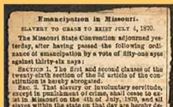
Newspaper clippings #2 - #3 - #4 - #5 - #6 - #7 - #8

Rare Book & Special Collections Division